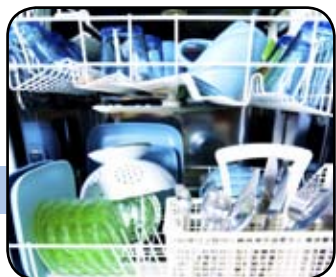
Better in the kitchen.