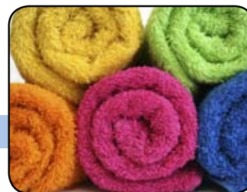
Better in the laundry.