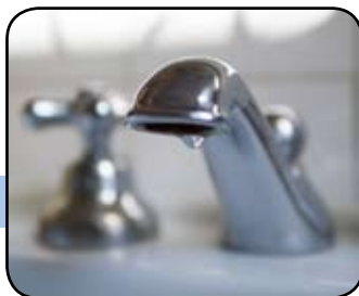
Better in the bathroom.