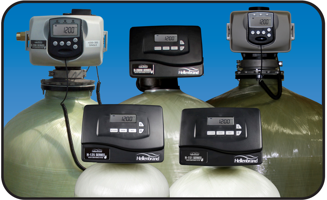
The H-Series Family H125, H151, H200, H200M, H300