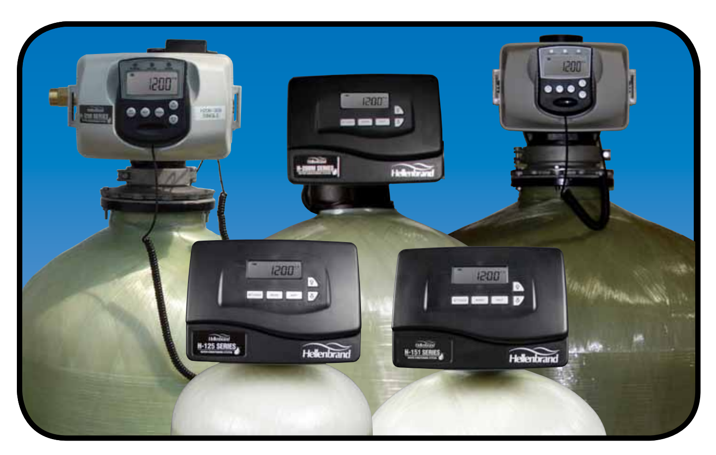
The H-Series Family H125, H151, H200, H200M, H300