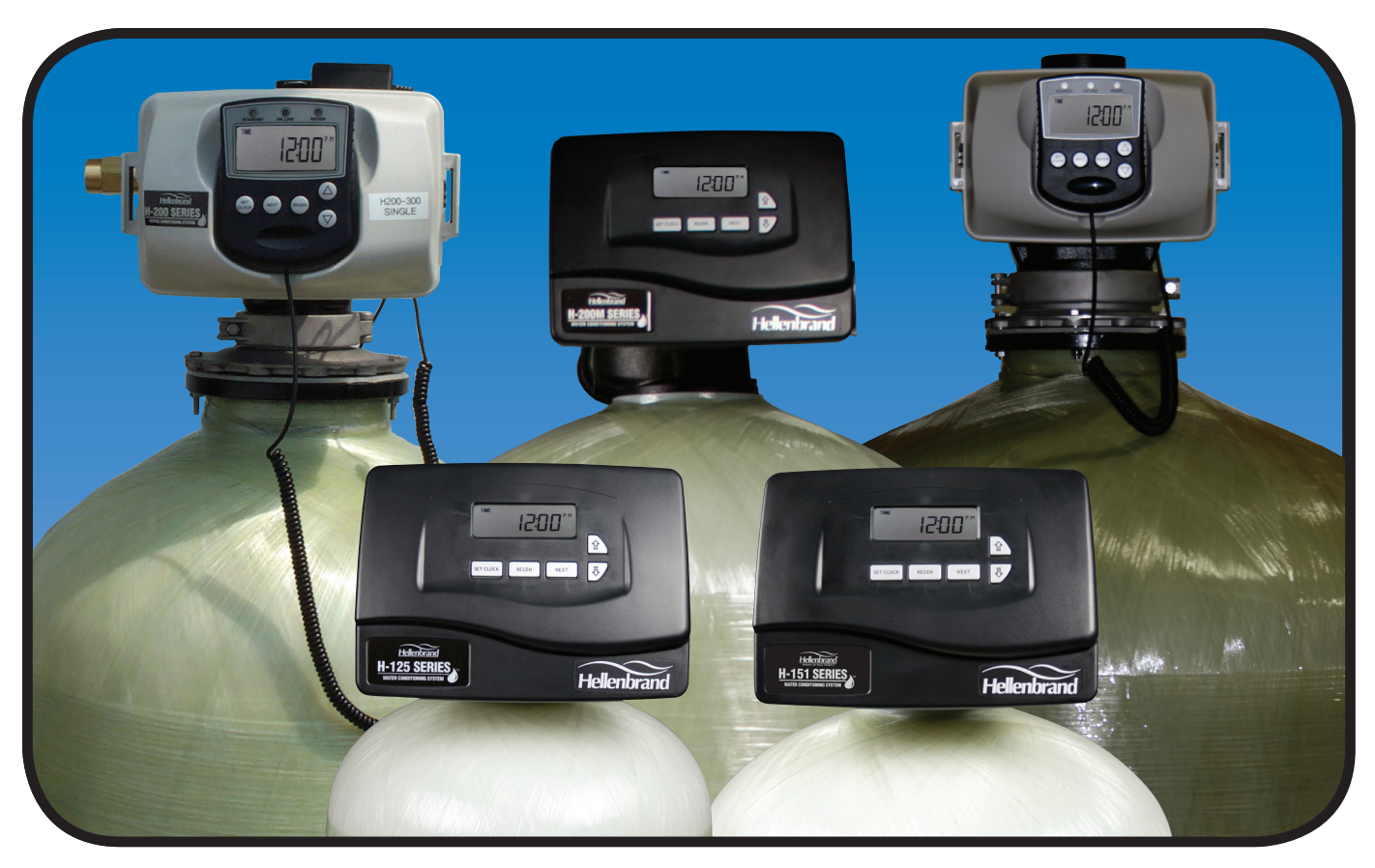
The H-Series Family H125, H151, H200, H200M, H300